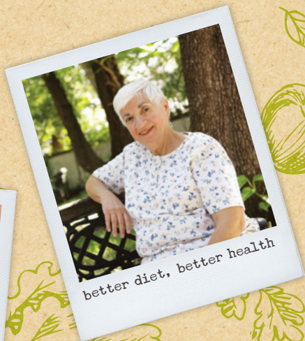
better diet, better health

Second Harvest FOOD BANK OF CENTRAL FLORIDA